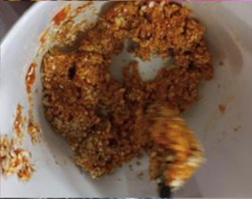
Making Treats For Our Therapy Dog Visitors