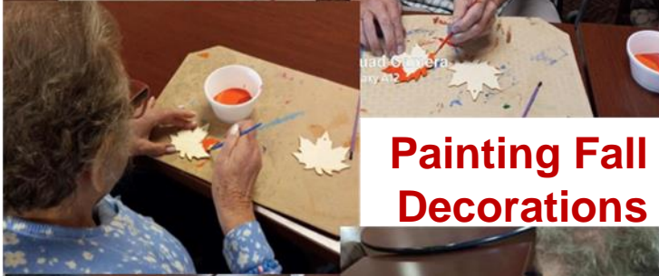
Painting Fall Decorations